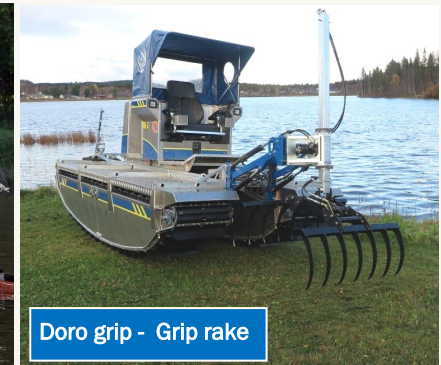
Doro grip - Grip rake