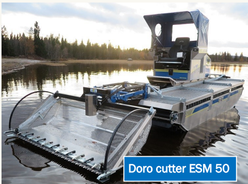
Doro cutter ESM 50